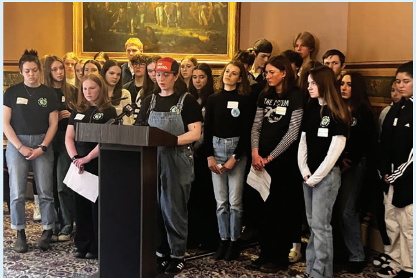
Young people from around Vermont call for swift and equitable climate action at the State House in Montpelier during the 2024 Youth Lobby Day.