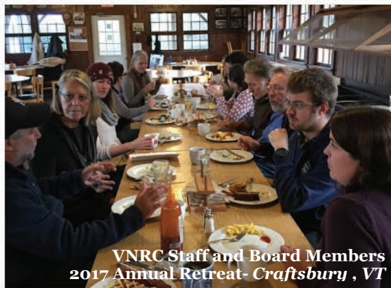
VNRC Staff and Board Members 2017 Annual Retreat- Craftsbury, VT