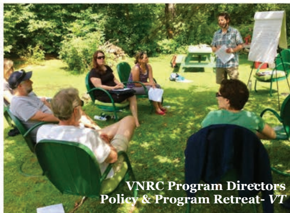
VNRC Program Directors Policy & Program Retreat- VT