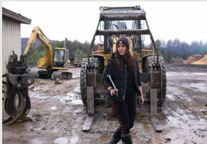
Northern Forest Center